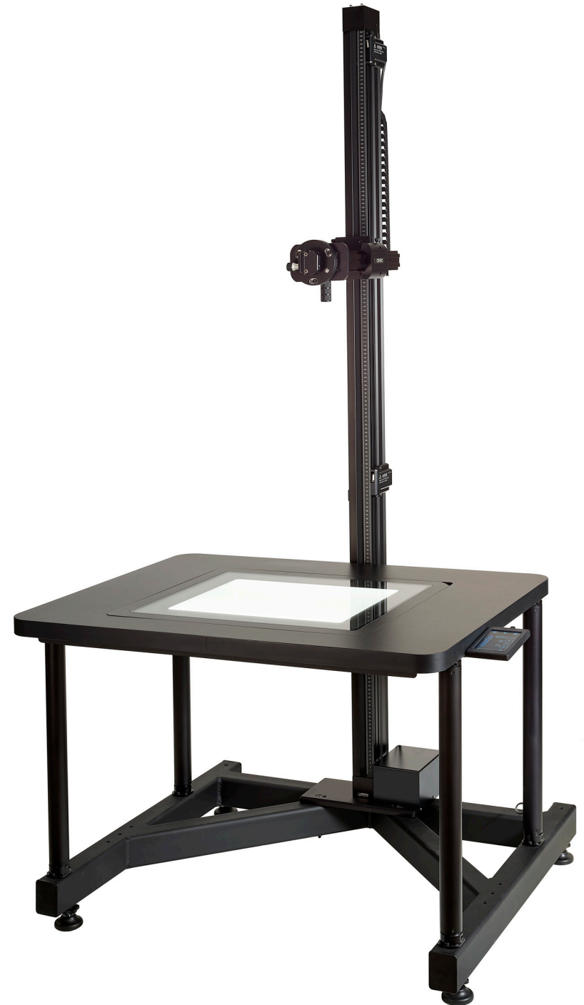
RPS-255 with RPS-165 and RPS-180 leveller

Dimensions base: 100x85x13cm Total height column and base: 216cm